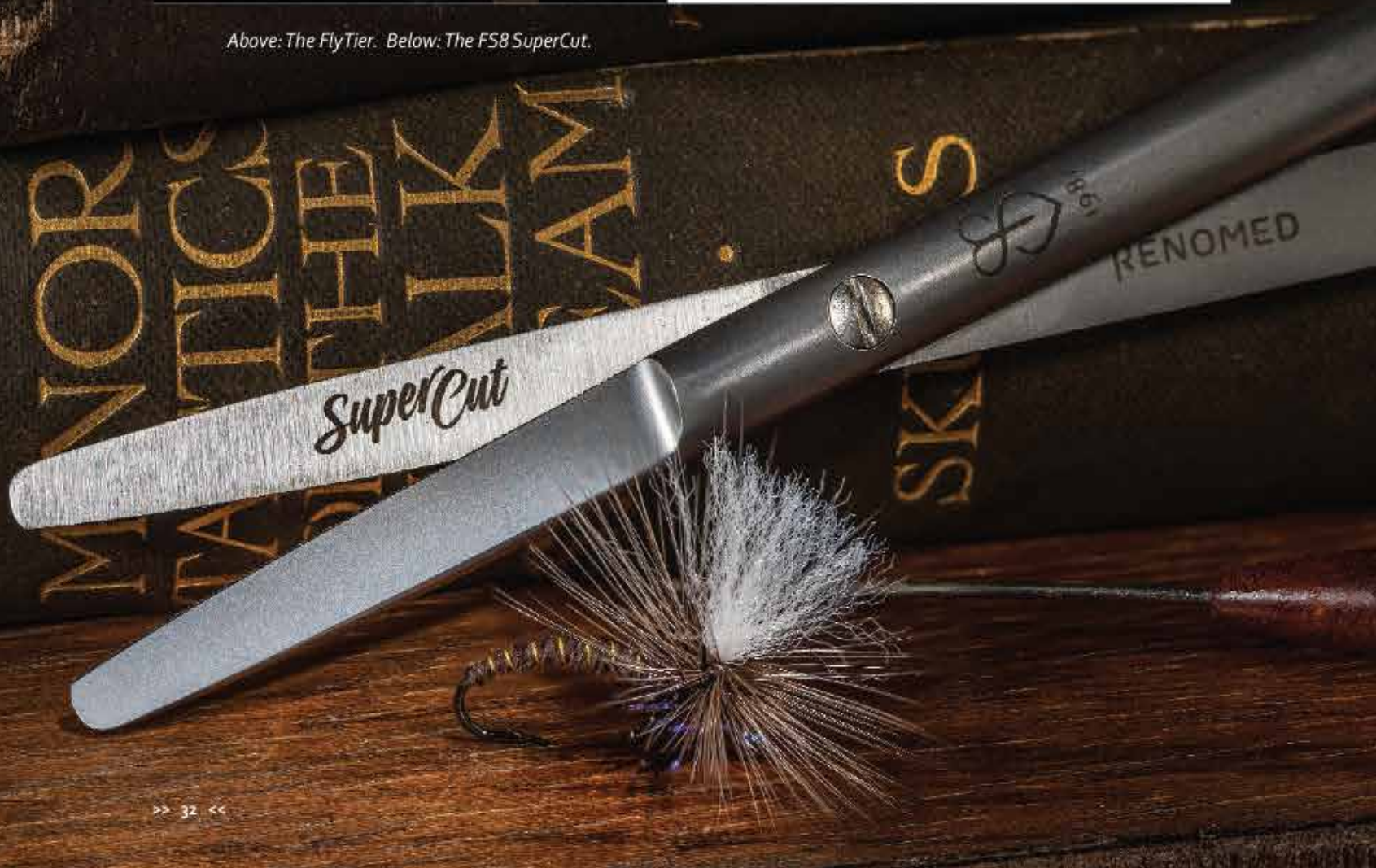
Above: The FlyTier. Below: The FS8 SuperCut.

Officially designed as serious fishing scissors for carp fishermen to cut all kinds of braids and fibres, the profile of the BraidCutter and its precise blade design allows for easy cutting through materials like Dacron, Spectra, Dyneema, Micro Dyneema, Twaron, Kevlar, Dynacords, GSP and more. The BraidCutter's blades include proprietary processes, and I use it to cut all kinds of super threads, aramid fibres and thicker parts of synthetics. The SuperCut blades are 20mm in length and have round tips.