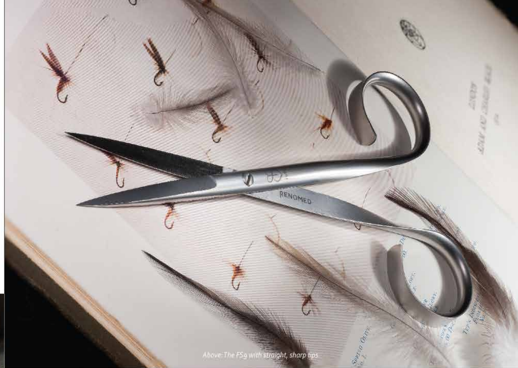
Above: The FS9 with straight, sharp tips